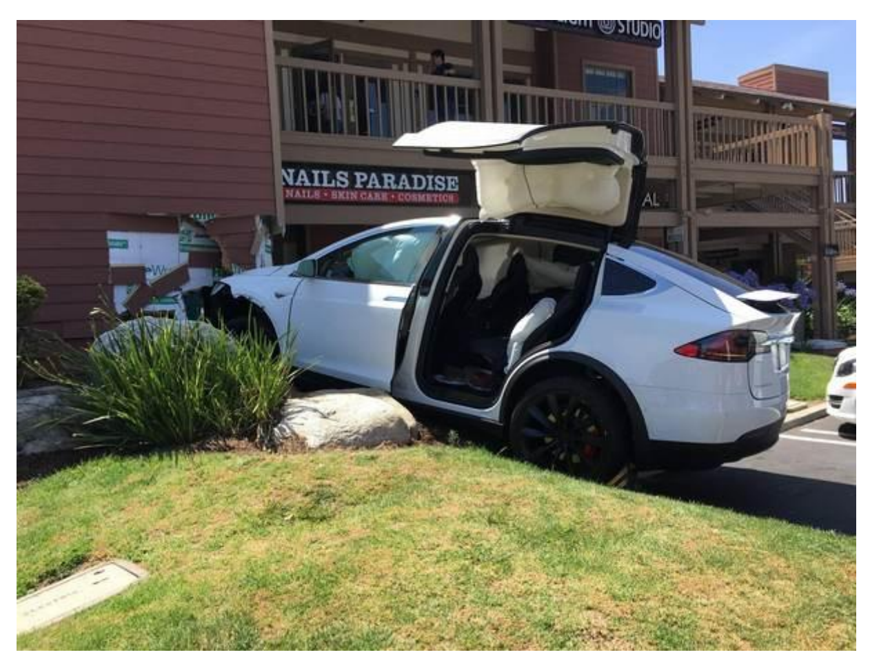
Another Horrific German Tesla Crash Proves Tesla Drivers Can't Drive - More FIREMAN Exposed to Deadly Tesla Fire Fumes